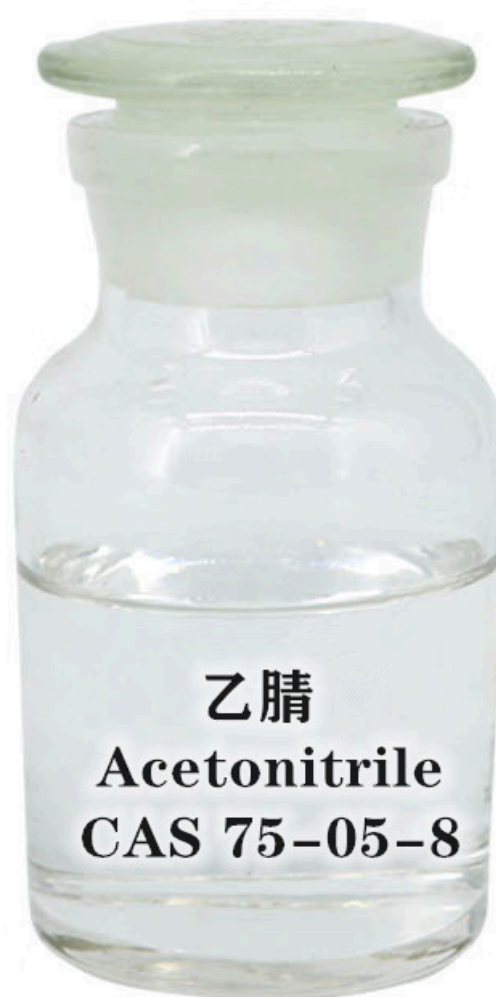
乙腈 Acetonitrile CAS 75-05-8