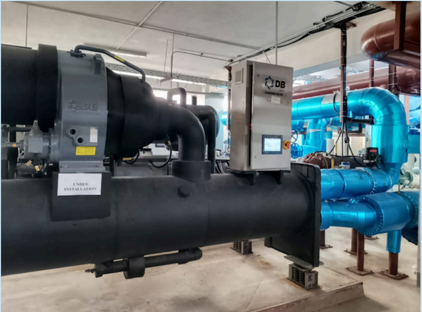
Boiler (EGB), Central Utility Building