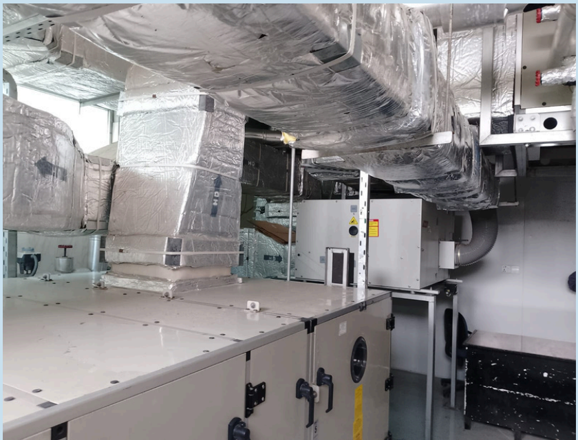
Dhamrai Project HVAC, Probiotic, Herbal Building